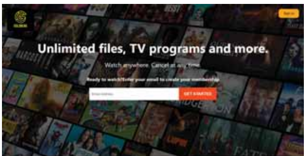
Figure 1. Sign up page.

Sign up page: Figure 1: This page is used for user to sign up to the application, we are using email id as user identity for Login after the giving the mail user will verify it and verify it and add other personal details.