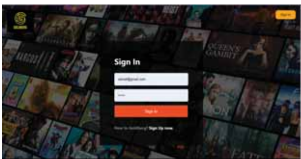
Figure 2. Sign in page

Sign in page: Figure 2: This page is used for user to login to the platform and use the website, could be able to login and if we not signed up there is a option for it, once click Login it will check in database whether the user exist if not will throw an error.