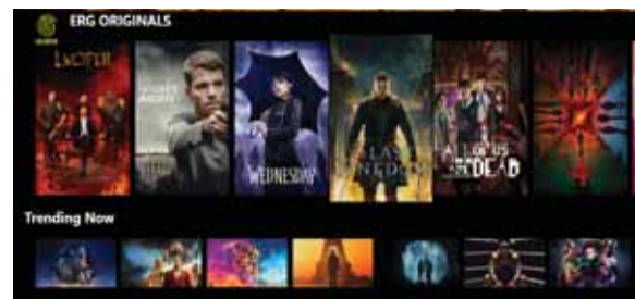
Figure 3. Home page

We use row module so that users could scroll movies from home page.