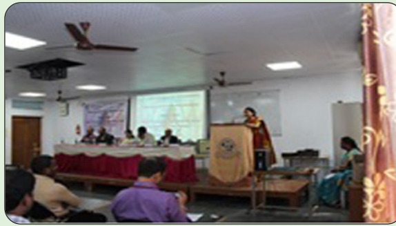
Inauguration of the Workshop