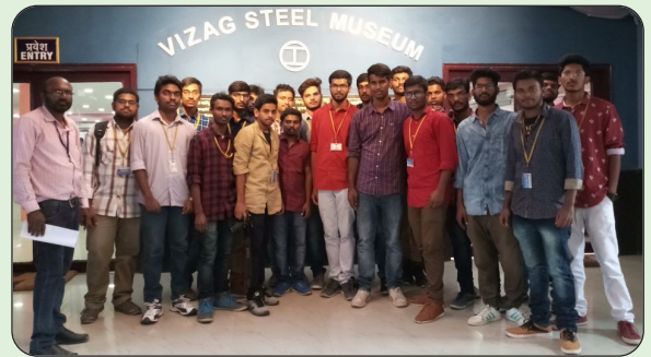
Students at Vizag Steel Plant