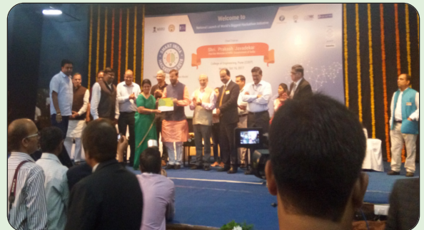
Principal Receives the Award for Hackathon