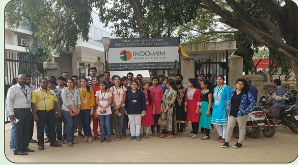
Students at INDO-MIM Pvt. Ltd.