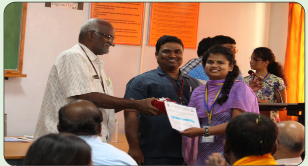
Participants Receiving Certificates