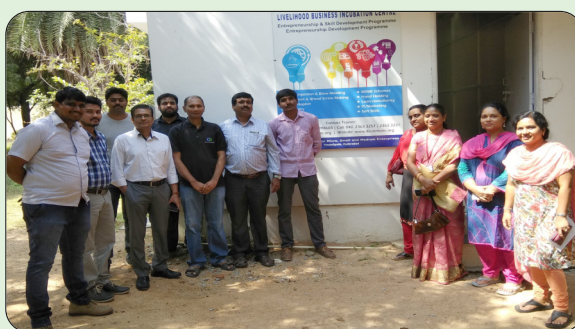
Faculty Members at the Workshop