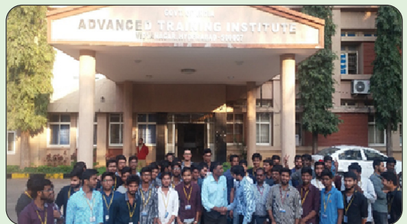
Students at ATI Plant