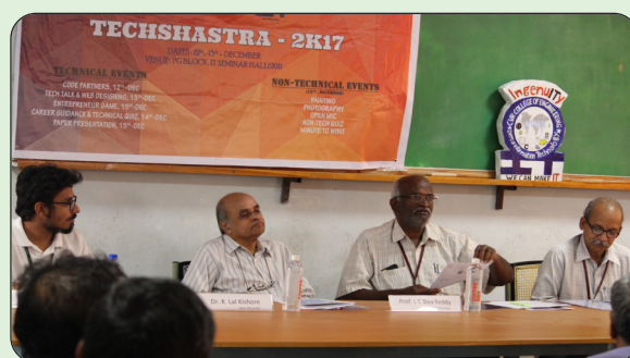
Valedictory Function, Techshastra 2K17

The Student Technical Association of IT department “IngenuTy” organized a departmental annual technical fest “ TECHSHAstra 2K17 ” for the students from 12 - 15 December, 2017 at CVR College of Engineering. There were 6 technical events, 5 non-technical events, 3 guest lectures along with technical paper presentations arranged for the students. The souvenir of the technical fest was released in the valedictory