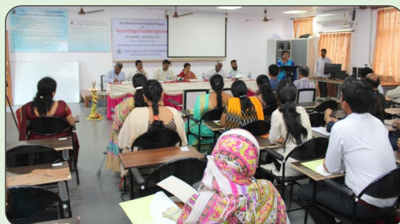
Workshop in Progress