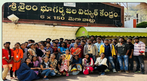
Industrial Visit to Srisailam Left Bank Hydrel Power Plant

The whole team included 56 students and 6 faculty members of EIE Department.