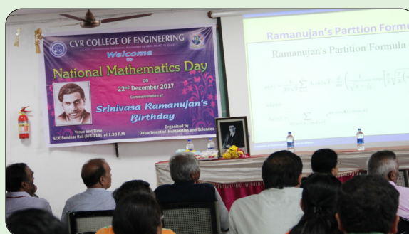
Presentation on National Mathematics Day