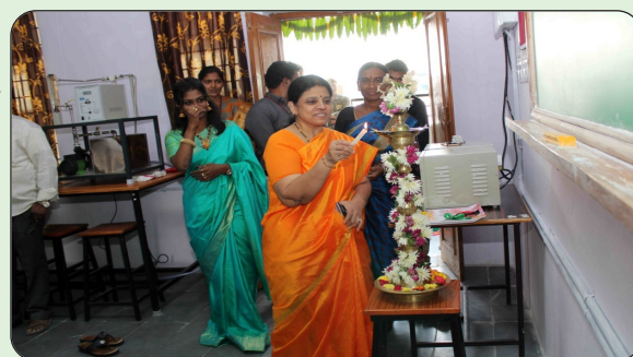
Inauguration of the Lab