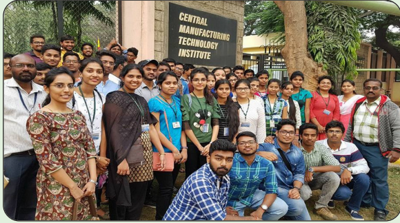
Students at CMTI