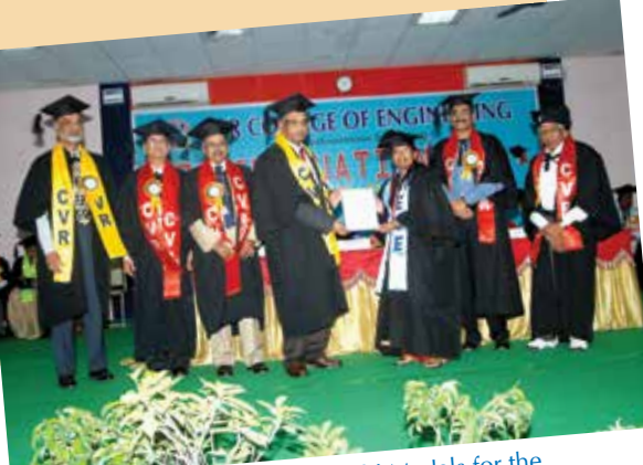
The winner of two Gold Medals for the outgoing batch of 2012.